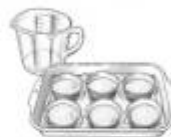
Baking custards in a water bath

▶ Allow time to chill the baked custards thoroughly before serving. Always store cooled custards or custard-based dishes tightly covered in the refrigerator, as they readily take on the flavors of strong-smelling foods.