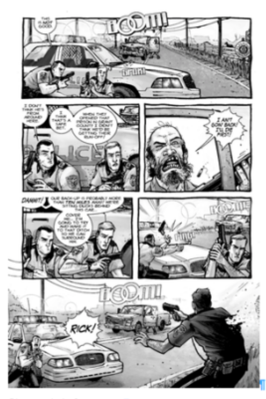
Six panels in four rows.

Row one has one wide panel, rows two and three each have two square panels, and row four has a wide, borderless panel with an image that bleeds behind the panels above.